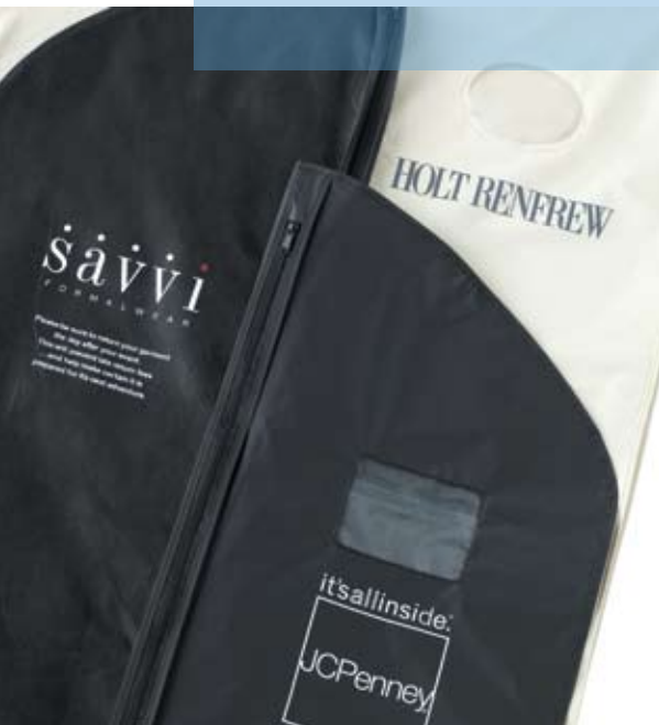
ZIPPER GARMENT BAGS