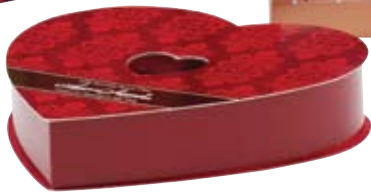
SHA SHA CO. EVERYDAY COOKIE DISPLAY BOX North American-made folding box